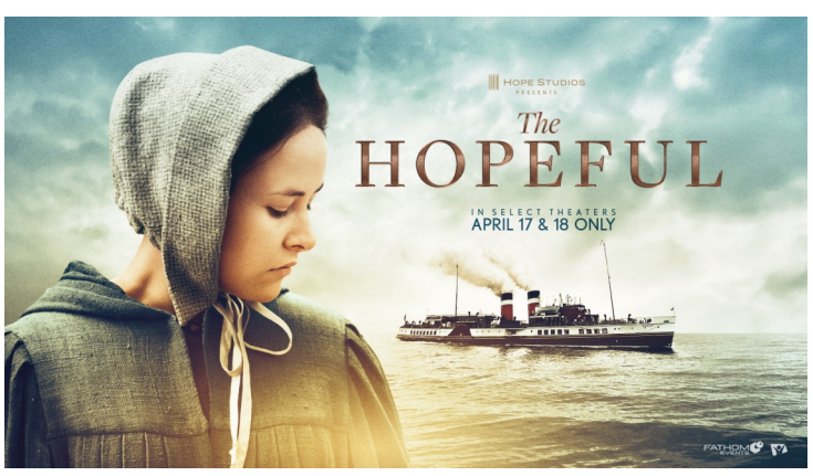
Search "The Hopeful Official Trailer" on YouTube or go to TheHopefulMovie.com to learn more.

Wouldn't it be great if non-Adventists poured into our churches saying, "I'm here because I saw your movie and want to learn more. There was an ad for the Adventist Church, so here I am!"